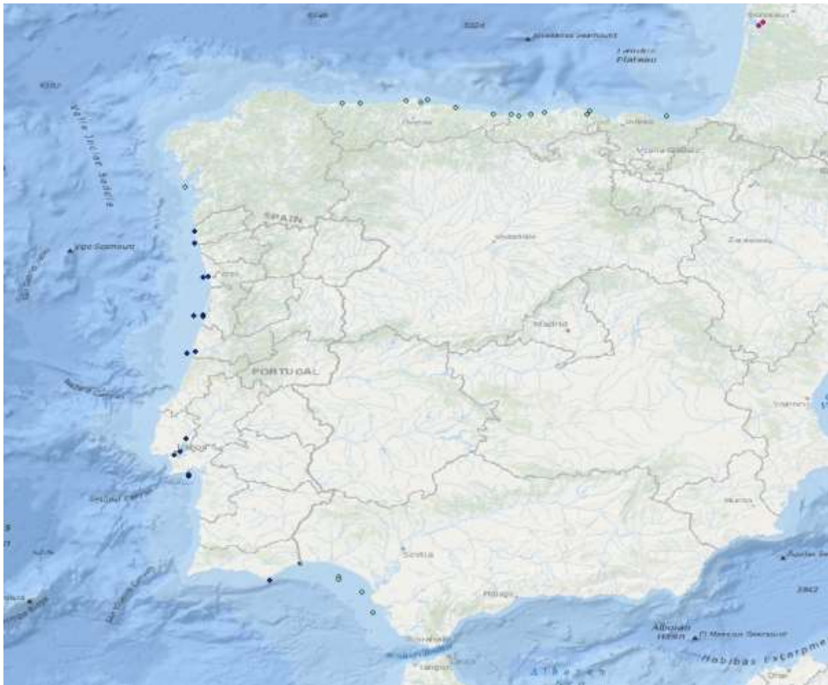
Sites used by Spain and Portugal (excluding one in the Azores) for dumping or placement of dredged material.