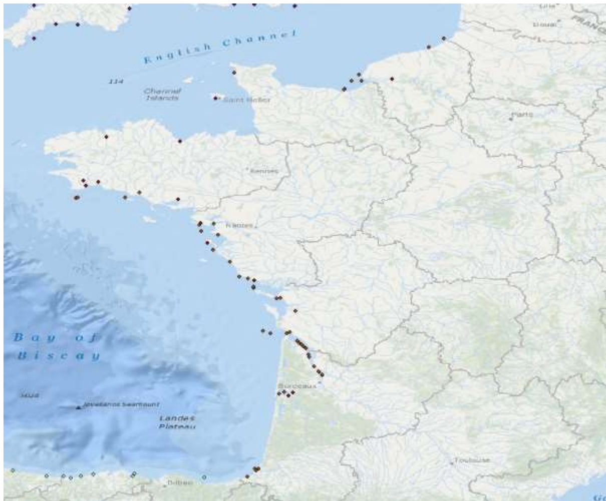
Sites used by France for dumping or placement of dredged material.