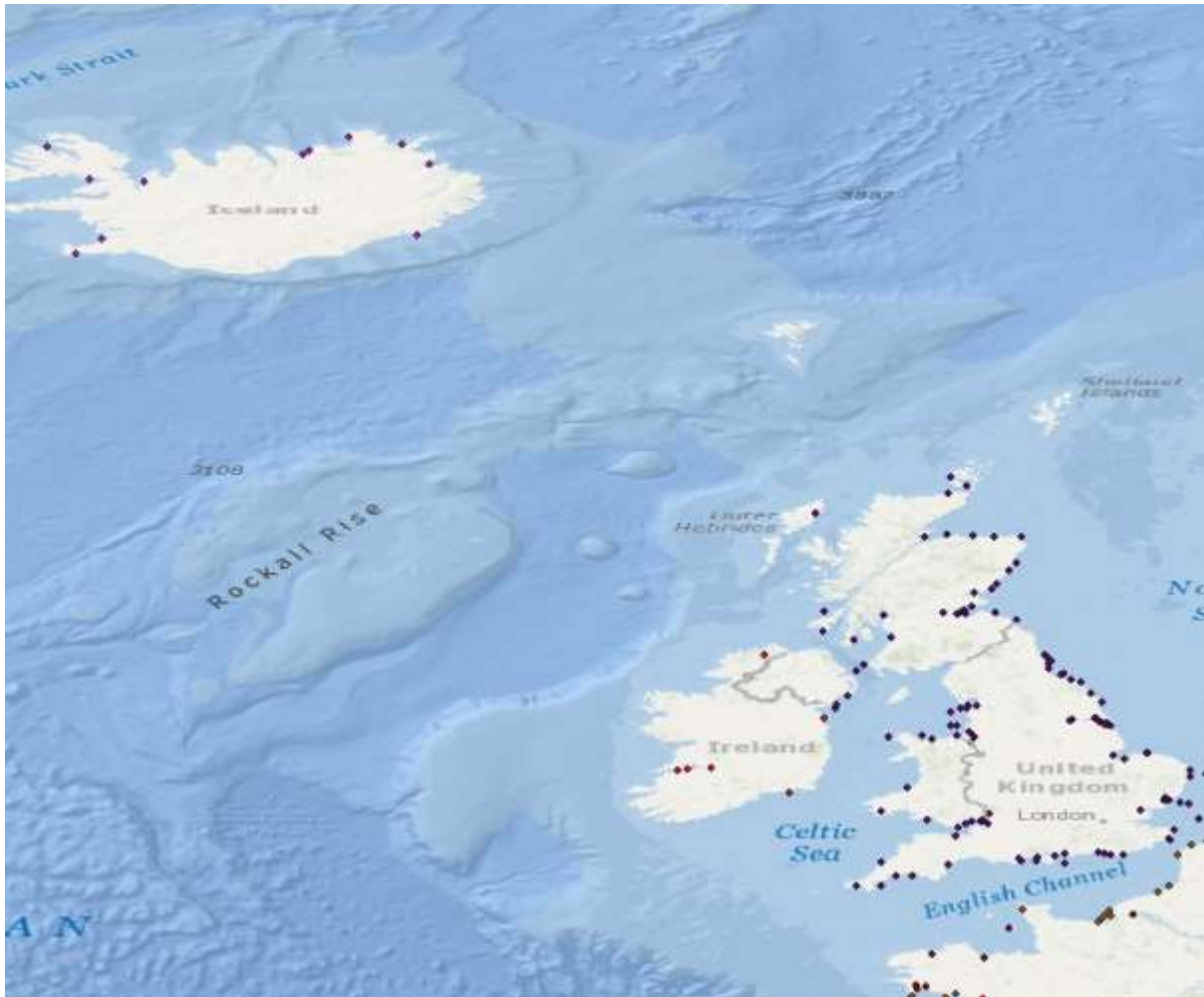
Sites used by Iceland, Ireland and UK for dumping or placement of dredged material.