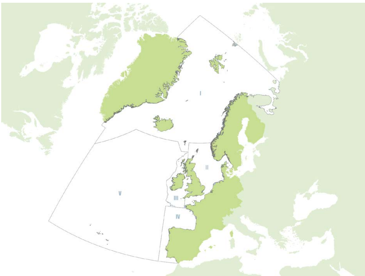
Figure 2. Map showing the geographic extent of the OSPAR Maritime Area and the five sub-regions.

the Law of the Seas, especially in Part XII and Article 197 on the global and regional cooperation for the protection and preservation of the marine environment. The OSPAR Convention recognises the jurisdictional rights of states over the seas and the freedom of the high seas, and, within this framework, the application of main principles of international environmental policy to prevent and eliminate marine pollution and to achieve sustainable management of the maritime area. This includes principles resulting from the 1972 Stockholm United Nations Conference on the Human Environment and of the 1992 Rio de Janeiro United Nations Conference on the Environment and Development, including the 1992 Convention on Biological Diversity.