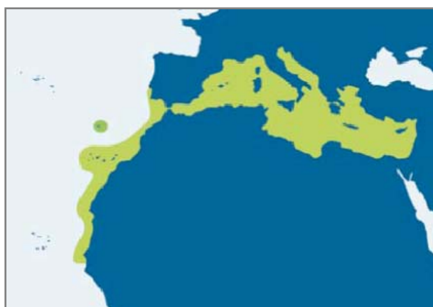
Figure 1: Global distribution of Cymodocea nodosa (in Espino et al. 2008)