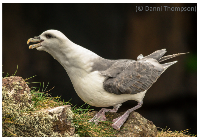
(© Danni Thompson)

This action will develop an overarching framework for the implementation of the RAP-Bird. It will identify the best approach for OSPAR to improve the implementation of measures of both listed and currently non-listed bird species, including OSPAR regional measures currently in place and those being developed under the RAP-Bird.